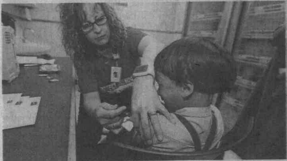
Vaccinations once had wiped out measles in the U.S., but the disease is returning from overseas.

More severe measles outbreaks have occurred in Angola, Cameroon, Chad, Kazakhstan, Nigeria, the Philippines,