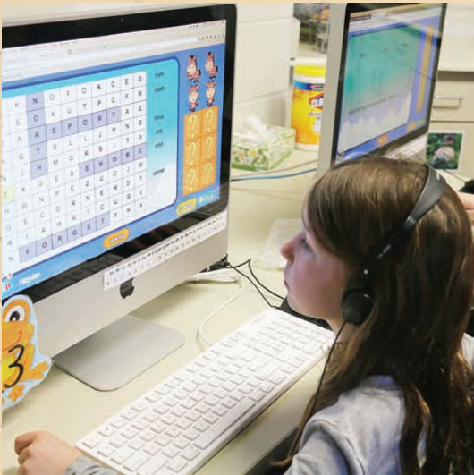
A student works on keyboarding skills in the Regina Elementary computer lab classroom.