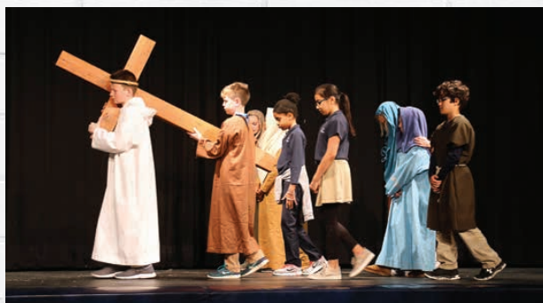
5th graders reenact Stations of the Cross.

Extra-curricular activities supplement the learning activities in our classrooms and provide students a chance to excel and develop other skills. Activities in areas such as art, choir, band, orchestra, drama, and robotics, give students a chance to pursue areas of interest with other students, develop positive student relationships and create a supportive school climate. Most of our junior high and high school students participate in at least one extra-curricular activity