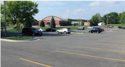
Newly resurfaced and expanded front parking lot