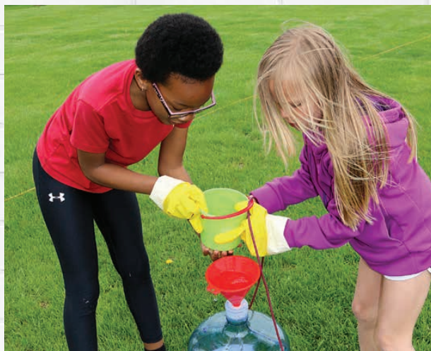
Elementary students have fun on Track and Field Day.

Regina is also deeply rooted in serving the community. All students are provided with opportunities to learn how to become a servant leader who serves the Church and the greater Iowa City area community, thus preparing Regina High School graduates to go out and serve the world!