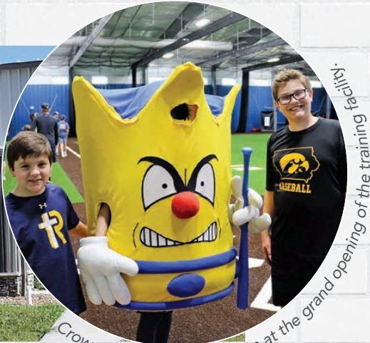
Crownie poses with students at the grand opening of the training facility.