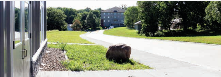
New First Avenue entrance/exit