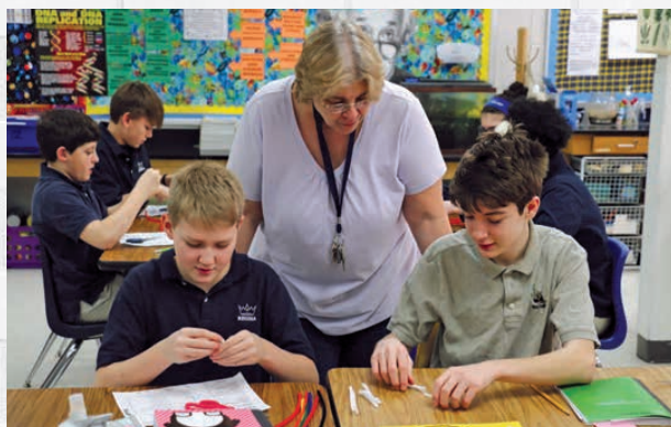
7th grade students build DNA models.

For 60 years, the Regina Catholic Education Center has been dedicated to making a difference — in our students' lives, in our community and in our world. We have created an educational environment that is learner-centered; values-rich; proudly steeped in our Catholic identity; service-oriented; and bold and fearless when considering new possibilities.