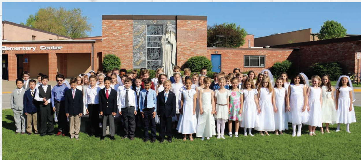
Second graders gather before their First Communion Mass Celebration.