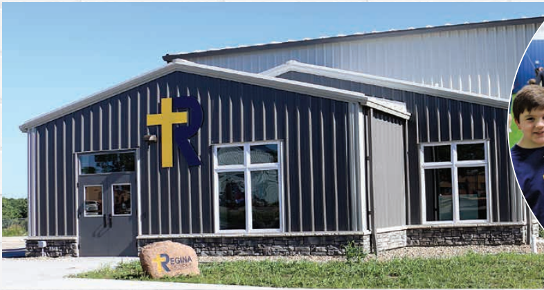
The new Regina Athletic Training Facility