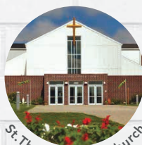
St. Thomas More Church