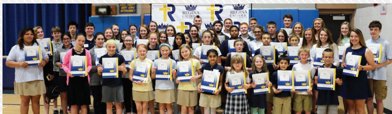
2018 Regina Foundation scholarship recipients

Kent Braverman Scholarship John & Charlotte Gavin Scholarship