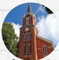
St. Mary Church