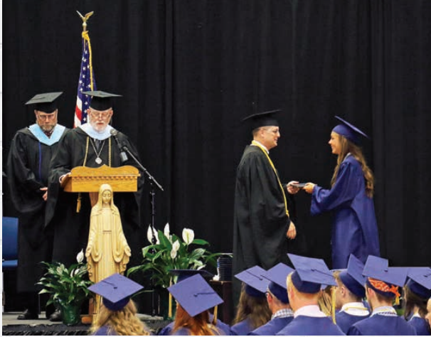
A Regina student receives her diploma at the 2018 graduation ceremony.