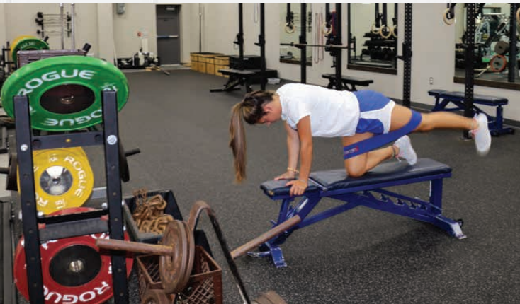
A student works out in the strength training area of the training facility.