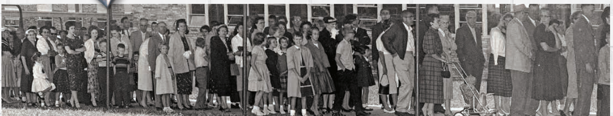
Regina High School officially opened its doors on September 3, 1958 to 295 students. Families lined up outside the building excited to take a tour of the new school.

We are excited to celebrate 60 Years of Excellence at Regina during the 2018–19 school year. Plans for special anniversary events throughout the year are underway!