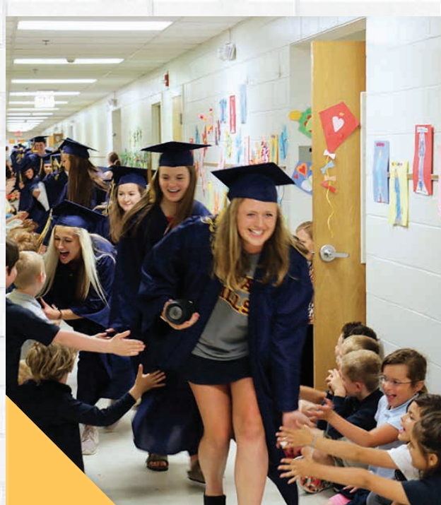
Seniors walk through the hallway of the elementary school in caps and gowns the last week of school.

"The recurring theme when asking new families why they chose Regina is they love our commitment to faith and academic excellence. This is the resounding common answer! New families love the morals and values that our teachers and staff instill in our students. They overwhelmingly appreciate the teachers' commitment to education and furthering their own professional learning during the summer months. Regina is no longer the 'best kept secret in the corridor."