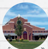
St. Patrick Church

R egina Catholic Education Center is blessed to have four wonderful parishes that support our school. We are grateful for their partnership and the care they give in time, talent, and treasure.