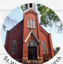
St. Wenceslaus Church